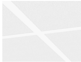
Hygiene Clinic A system